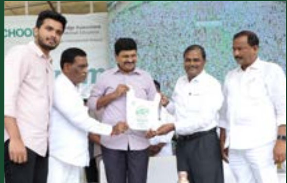
Illustrating the Importance of Bio Covers to Our Guest MP Joginapally Santosh Kumar