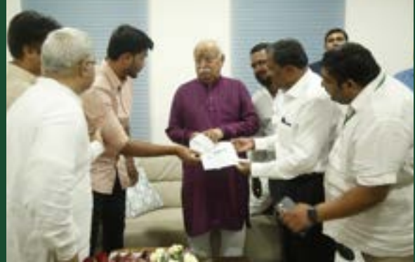
Illustrating the Importance of Bio Covers to Our Guest Mohan Bhagwat