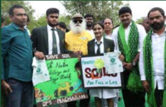
Illustrating the Importance of Bio Covers to Our Guest Sadhguru